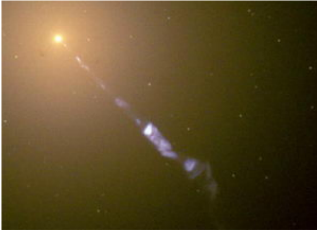
Fig. 1: Image of radio galaxy M 87 seen in visible light. The central region, from which the VHE gamma rays are seen, is located in the upper left part of the image and the relativistic plasma jet extends to the bottom right.

The astrophysicists of the international H.E.S.S. collaboration report the discovery of fast variability in very-high-energy (VHE) gamma rays from the giant elliptical galaxy M 87. The detection of these gamma-ray photons - with energies more than a million million times the energy of visible light - from one of the most famous extragalactic objects on the sky is remarkable, though long-expected given the many potential sites of particle acceleration (and thus gamma-ray production) within M 87. Much more surprising was the discovery of drastic gamma-ray flux variations on time-scales of days.