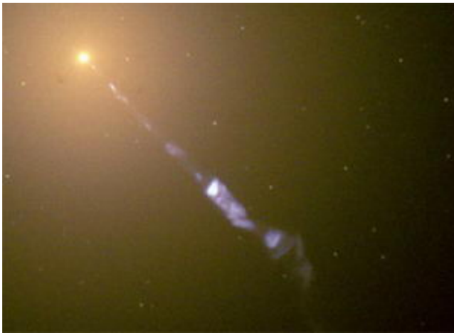
Fig. 1: Image of radio galaxy M 87 seen in visible light. The central region, from which the VHE gamma rays are seen, is located in the upper left part of the image and the relativistic plasma jet extends to the bottom right. Image: Hubble Space Telescope (HST)

The astrophysicists of the international H.E.S.S. collaboration report the discovery of fast variability in very-high-energy (VHE) gamma rays from the giant elliptical galaxy M 87. The detection of these gamma-ray photons - with energies more than a million million times the energy of visible light - from one of the most famous extragalactic objects on the sky is remarkable, though long-expected given the many potential sites of particle acceleration (and thus gamma-ray production) within M 87. Much more surprising was the discovery of drastic gamma-ray flux