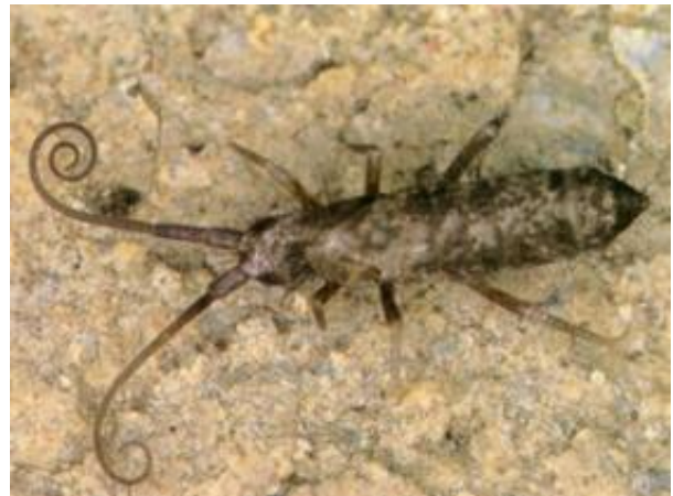
Tomocerus longicornis found in Europe

extinct Collembola through painstaking analysis of amber samples dating from the mid-Cretaceous period, about 95 million years ago.