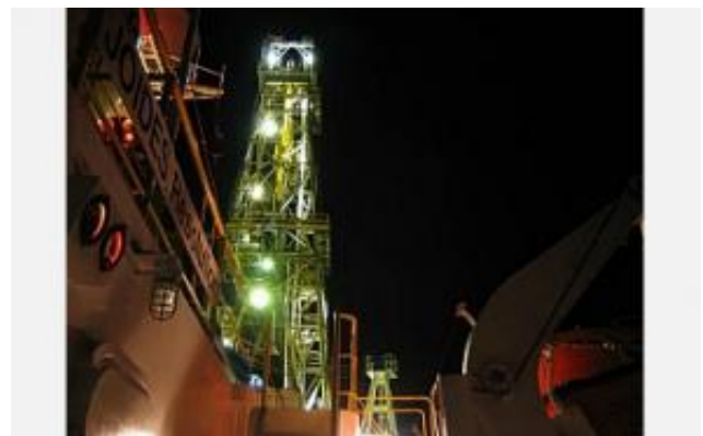
The derrick of the JOIDES Resolution, the scientific drilling ship used to recover the intact section of ocean crust.

Formation of ocean crust is a key process in the cycle of plate tectonics; it constantly ‘repaves’ the Earth’s surface, builds mountains, and leads to earthquakes and volcanoes. Project MoHole, begun in the 1950s, aimed to drill all the way through the ocean crust, into the Earth’s mantle.