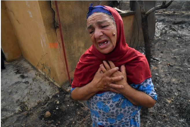
An Algerian woman in front of the ruins of her home, destroyed in a wildfire in the city of El Kala, on August 18, 2022.

Algerian firefighters on Thursday brought under control a string of forest blazes that have killed at least 38 people including 12 who died in a bus trapped by the flames.