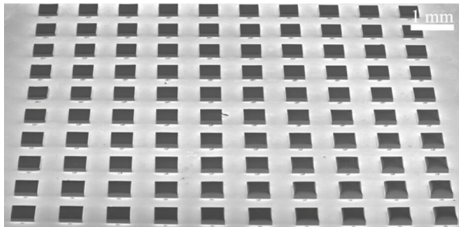
SEM micrograph of a cuboid parameter sweep comprising 10 x 10 elements fabricated via TPP from the photoresist IP-Q.

Additive manufacturing (AM) using two-photon polymerization lithography (TPP) has increased in usage in industry and research. Currently, a major constraint of TPP in general and specifically of the material IP-Q (Nanoscribe GmbH, Germany) is the users' limited access to knowledge about material properties. Due to the nature of the process, the elastic properties in particular depend not only on the utilized material but also on structure size, process, and fabrication parameters. For example, before research recently published in the Journal of Optical Microsystems , no degree of conversion (DC) and Young's modulus (E) values for IP-Q had been reported.