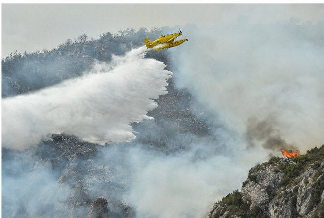
Forest fires raged in several parts of Spain this week.

In France, special measures have been taken in care homes for elderly people, still marked by the memory of a deadly 2003 heatwave.