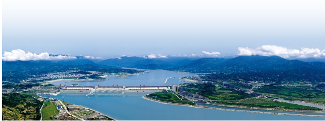
Panoramic view of the Three Gorges Dam on the Yangtze River, China.

Dams are conventionally regarded as emitters of GHGs in large rivers. A team from Peking University of China, however, has disrupted this perception, based on whole system thinking applied to the Three Gorges Dam (TGD) on the Yangtze River in China.