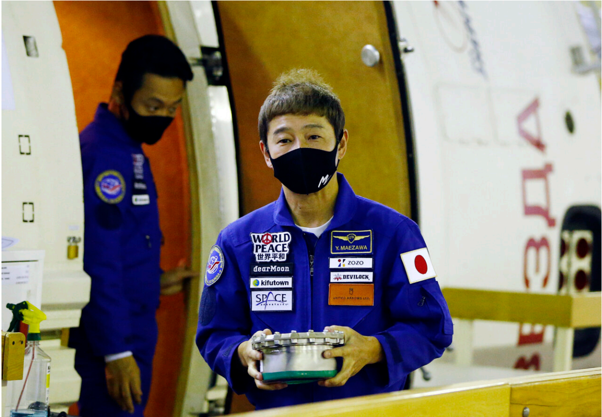
Space flight participant Yusaku Maezawa, foreground, attends a training ahead of the expedition to the International Space Station, at the Gagarin Cosmonauts' Training Center in Star City outside Moscow, Russia, Thursday, Oct. 14, 2021. A Japanese fashion tycoon who's booked a SpaceX ride to the moon is going to try out the International Space Station first. Yusaku Maezawa announced that he's bought two seats on a Russian Soyuz capsule. He'll blast off in December on the 12-day mission with his production assistant and a professional cosmonaut.