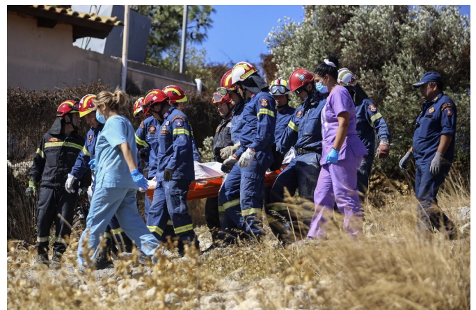
The dead man had been repairing a church with his son alongside him.