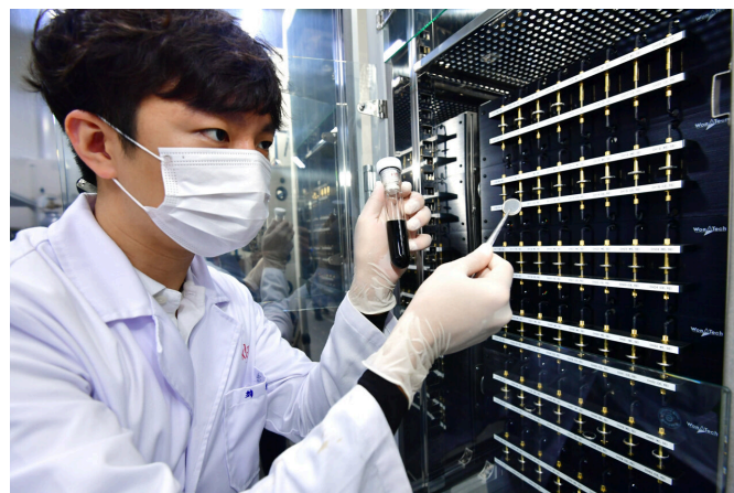
A KIST researcher conducts an experiment to evaluate high-capacity batteries following prelithiation.

While most commercial Li batteries have a graphite anode, SiO x has been garnering significant attention as a next-generation material for anodes due to its high capacity, which is five to 10 times greater than graphite. Yet, SiO x also irreversibly consumes three times as much active Li as graphite. As a result, a composite electrode, consisting of a mixture of graphite and SiO x , is now gaining recognition as an alternative for practical next-generation anodes. However, while there was a corresponding increase in the capacity of graphite-SiO x composite electrodes at higher ratios of SiO x , there was also an increase in loss of initial Li. Consequently, the ratio of SiO x content in a graphite-SiO x composite electrode was limited to 15%, as increasing the ratio to 50% would result in an initial Li loss of 40%.