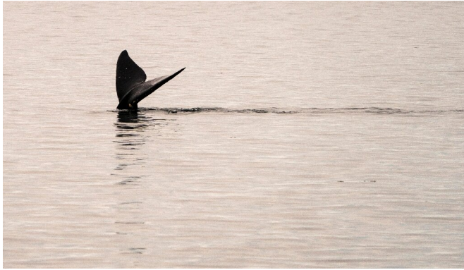
A North Atlantic right whale swims in the waters of Cape Cod Bay near Provincetown, Massachusetts.

Most vessels are exceeding speed limits in areas designated to protect critically endangered North Atlantic right whales, of which only around 360 remain, a report said Wednesday.