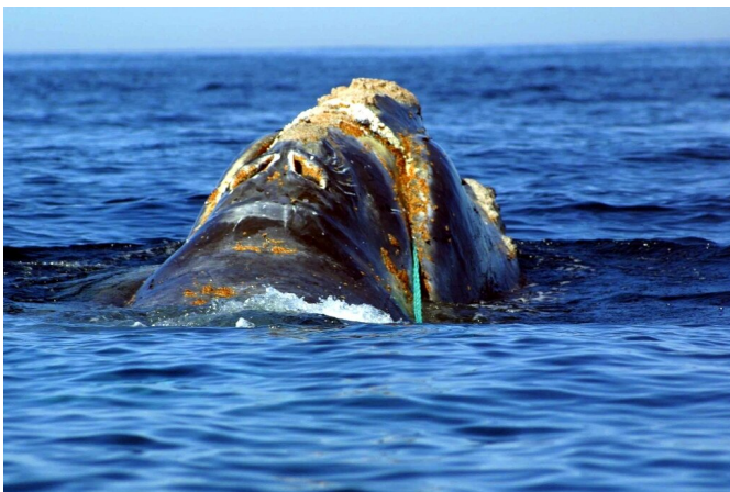
An endangered North Atlantic right whale is entangled in heavy plastic fishing line off Cape Cod, Mass.

In February, NOAA reported a calf died from propeller wounds, broken ribs, and a fractured skull from a collision with a 54-foot (16.4 meter) recreational fishing vessel.