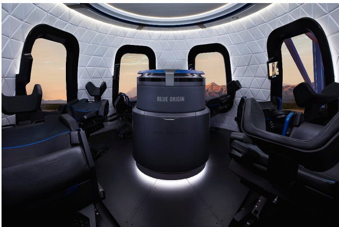
This undated handout photo obtained on July 1, 2021 shows the interior of the Blue Origin crew capsule.

After lift-off, New Shepard will accelerate towards space at speeds exceeding Mach 3 using a liquid hydrogen /liquid oxygen engine with no carbon emissions.