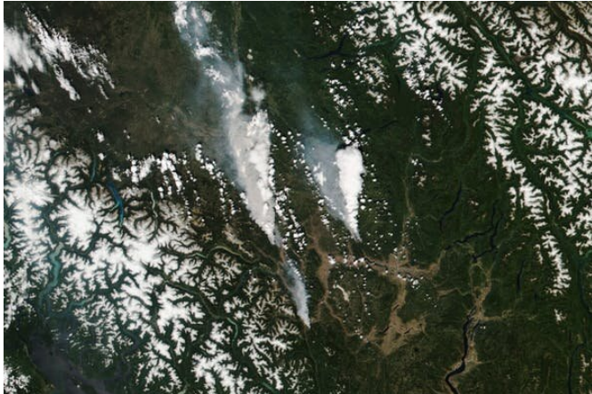
The North American heatwave has seen fires spread across the landscape.

common, and they form when air is displaced north or south by mountains, other weather systems or large areas of rain.