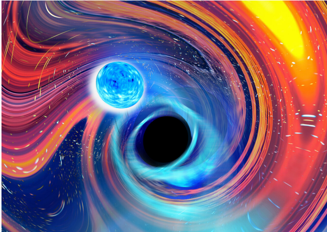
An artistic image inspired by a black hole-neutron star merger event.

A long time ago, in two galaxies about 900 million light-years away, two black holes each gobbled up their neutron star companions, triggering gravitational waves that finally hit Earth in January 2020.