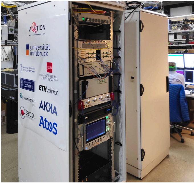
The compact quantum computer fits into two 19-inch server racks.

In addition to stability, a decisive factor for the industrial use of a quantum computer is the number of available quantum bits. Thus, in its recent funding campaign, the German government has set the goal of initially building demonstration quantum computers that have 24 fully functional qubits. The Innsbruck quantum physicists have already achieved this goal. They were able to individually control and successfully entangle up to 24 ions with the new device. "By next year, we want to be able to provide a device with up to 50 individually controllable quantum bits," says Thomas Monz, already looking to the future.