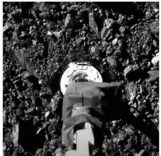
In this image taken from video released by NASA, the Osiris-Rex spacecraft touches the surface of asteroid Bennu on Tuesday, Oct. 20, 2020.

Set to launch in October, a spacecraft named Lucy will fly past swarms of asteroids out near Jupiter, while a spacecraft known as Dart will blast off in November in an attempt to redirect an asteroid as part of a planetary protection test. Then in 2022, the Psyche spacecraft will take off for an odd, metallic asteroid bearing the same name. None of these missions, however, involve sample return.