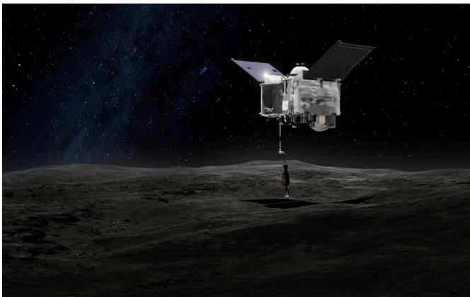
This artist's rendering made available by NASA on Tuesday, Sept. 6, 2016 shows the Origins Spectral Interpretation Resource Identification Security - Regolith Explorer (OSIRIS-REx) spacecraft contacting the asteroid Bennu with the Touch-And-Go Sample Arm Mechanism.

Although the asteroid is 178 million miles (287 million kilometers) away, Osiris-Rex will put another 1.4 billion miles (2.3 billion kilometers) on its odometer to catch up with Earth.