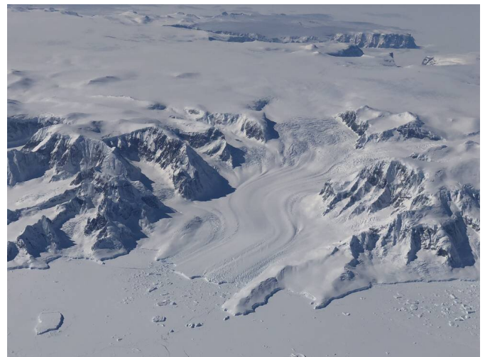
Using data from the ICESat and ICESat-2 laser altimeters, scientists precisely measured how much ice has been lost from ice sheets in Antarctica and Greenland between 2003 and 2019. The Antarctic Peninsula, seen here, was one of the fastest changing regions of the continent.

mission , and its successor, GRACE Follow-On, scientists have studied changes in ice sheet mass balance. The missions have measured variations in Earth's gravitational pull in response to surface mass and water changes.