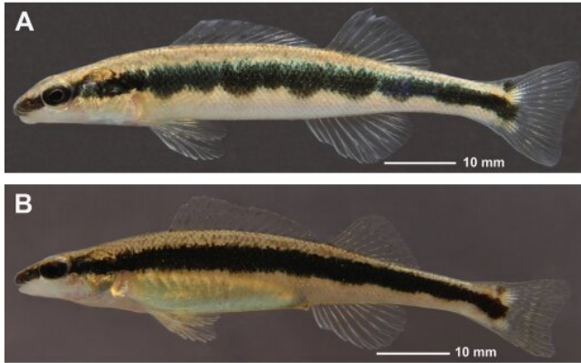
The Percina freemanorum. Both specimens collected from Amicalola Creek, Dawson County, Georgia.