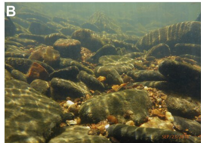
The habitat of the newly discovered fish in Amicalola Creek, Dawson County, Georgia.