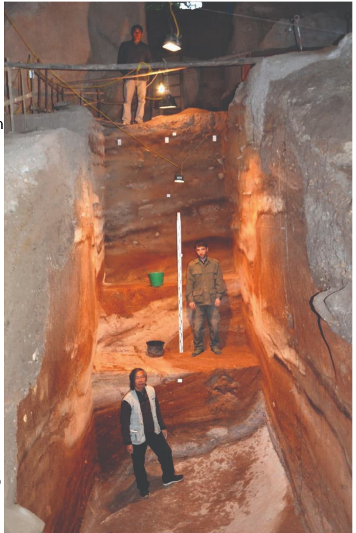
Archaeologists in the guano deposit at Con Moong Cave.

"It absolutely stank, just like human poo, because of the activities of bacteria in the anoxic waterlogged environment. They produced hydrogen sulfide, which smells like rotten eggs, and they produced a lot of it.