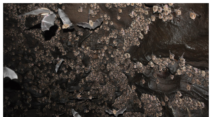
The eastern horseshoe bats ( Rhinolophus megaphyllus ) that provided the raw material for the experiment.

"We also wanted to understand how that environment might have changed, and whether archaeological remains might have been destroyed as a result of those changing environments, or the presence of bat guano.