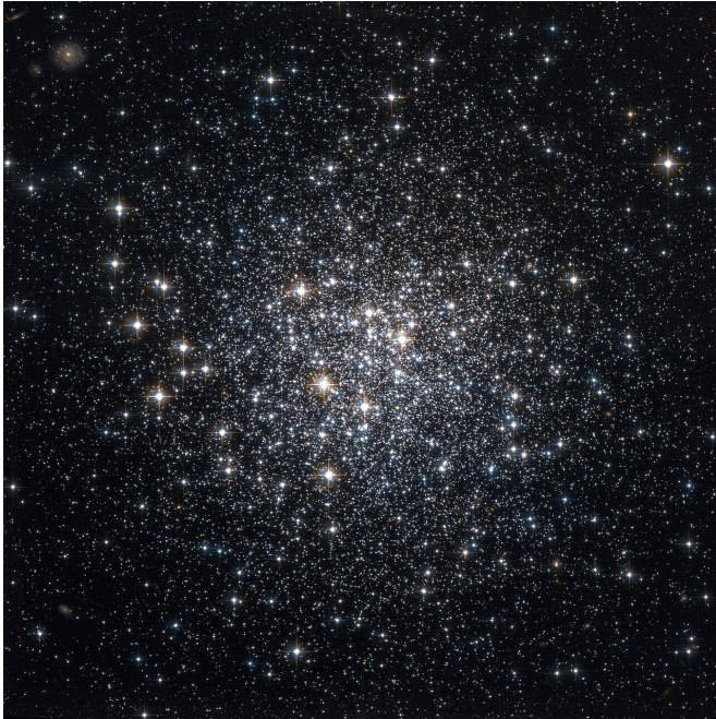
Fig.1: Hubble Space Telescope image of NGC 6981. Globular clusters are old and dense star systems where a central IMBH may hide in their core regions.

Globular clusters are old and dense star systems in the Galaxy halo and bulge. Their average age is almost equal to the age of our universe.