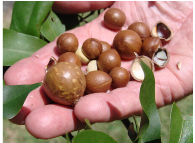
Different nut sizes from Nuts from Macadamia integrifolia and M. janseni.