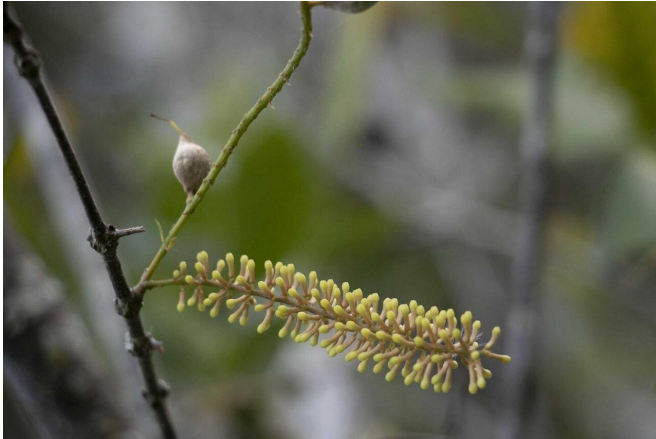
The flower or raceme of the critically endangered Macadamia jansonii - one of four macadamia species that are native to Australia.

One of the world's rarest tree species has been transformed into a sophisticated model that University of Queensland researchers say is the future of plant research.