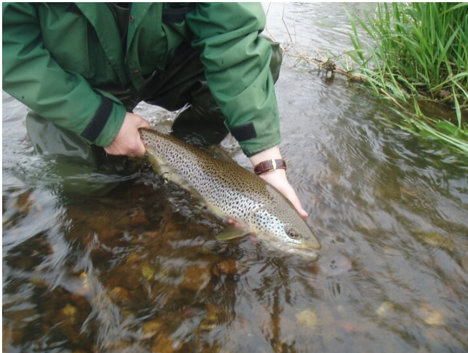
Trout.

New research from the University of Aberdeen could pave the way for the development of drugs and vaccines to treat a disease that is rapidly emerging in wild and farmed fish in the UK, Europe and North America, as a result of climate change.