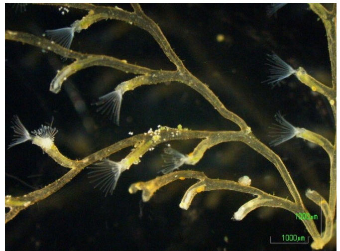
Invertebrate (bryozoan) host.

Only a minority of these parasites go on to cause serious disease in animals, such as fish, including the parasite that causes PKD, called Tetracapsuloides bryosalmonae . Rising freshwater temperatures is leading to an increase in disease instances caused by these parasites.