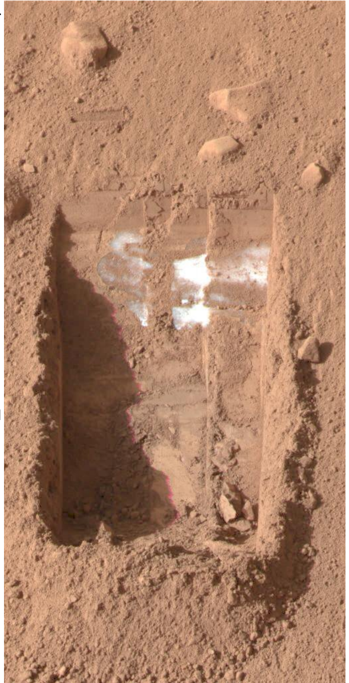
NASA's Phoenix Mars Lander shows the trench, called 'Dodo-Goldilocks,' lacking lumps of ice seen previously. The ice had sublimated, a process similar to evaporation, over the course of four days.

Ask Mars scientists and engineers where the most accessible subsurface ice is, and most will point to the area below Mars' polar region in the northern hemisphere. On Earth, this region is where you find Canada and Europe; on Mars, it includes the plains of Arcadia Planitia and glacier-filled valleys in Deuteronilus Mensae.