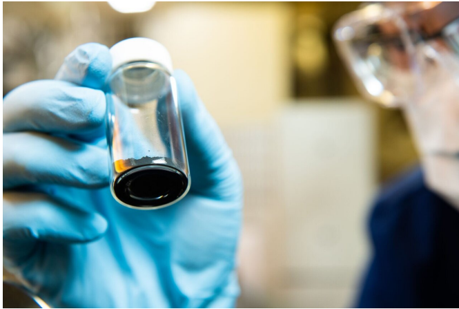
A collection of nickel-rich crystals.

unwanted chemical reactions induced by high nickel content and generating gas. This irreversible damage results in a battery with a nickel-rich cathode that fails faster and raises safety concerns.