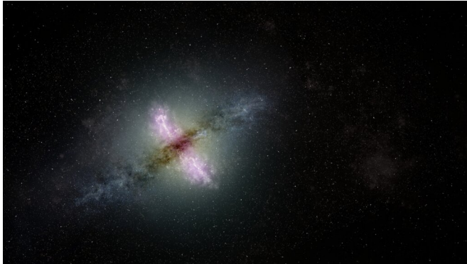
Artist's conception of a galaxy with an active nucleus propelling jets of material outward from the galaxy's center.

Astronomers using data from the ongoing VLA Sky Survey (VLASS) have found a number of distant galaxies with supermassive black holes at their cores that have launched powerful, radio-emitting jets of material within the past two decades or so. The scientists compared data from VLASS with data from an earlier survey that also used the National Science Foundation's Karl G. Jansky Very Large Array (VLA) to reach their conclusion.