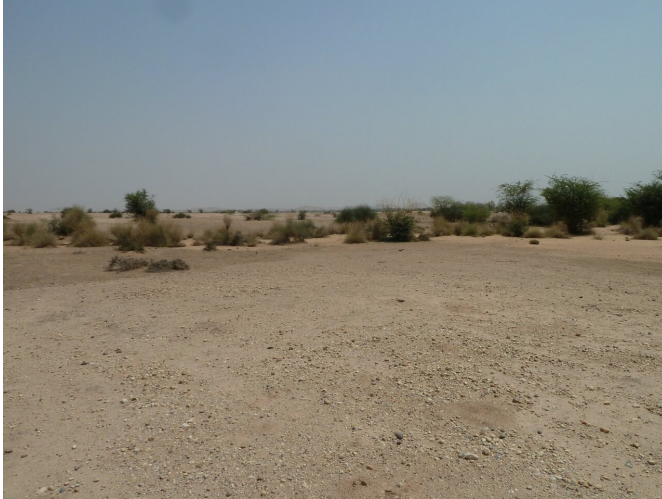
The flat, desert landscape around the study site at Nal.

River between 3200-1500 BCE, and is thought to have inspired the mythological Saraswati River mentioned in the Rig Veda.