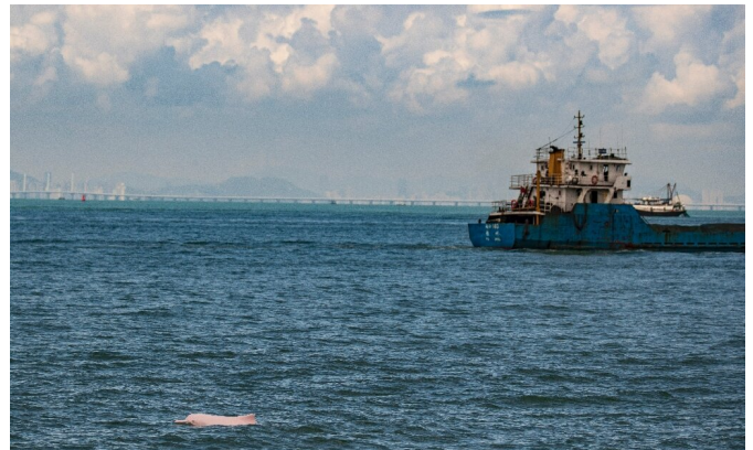
The rare pink dolphins are returning to the waters between Hong Kong and Macau after the coronavirus pandemic halted ferries

Factfile on Chinese white dolphins, also known as Hong Kong pink dolphins.