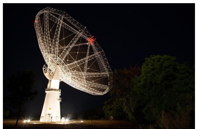
A GMRT Antenna at night.