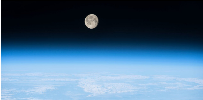
Photo of a nearly full Moon shining brightly on the Earth's atmosphere, taken from the International Space Station.