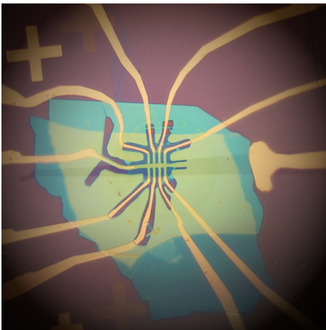
Optical microscope image of a twisted double bilayer graphene device.

As part of their study, Yankowitz and his colleagues measured electrical transport as a function of temperature and magnetic field. When there is a small magnetic field, the sign of resistance transverse to the applied current, which is known as Hall resistance, indicates what type of subatomic particles (i.e., electrons or 'holes') are the primary charge carriers inside a material.