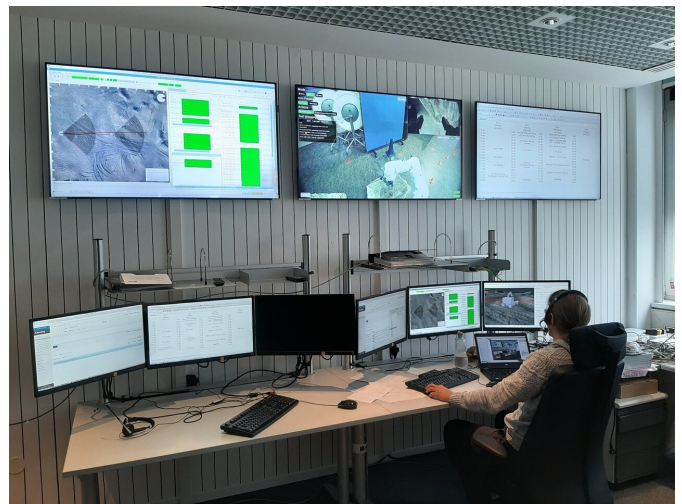
A controller in Germany operated ESA's gripper-equipped Interact rover around a simulated moonscape at the Agency's technical heart in the Netherlands, to practice retrieving geological samples. A controller in the European Space Operations Centre, ESOC, in Darmstadt, Germany, helped to to select and retrieve geological samples – overseeing the activities in 'space'.

This testing is the latest in a series of progressively more challenging human-robot test campaigns, collectively called Meteron—Multi-purpose End-to-End Robotic Operation Network.