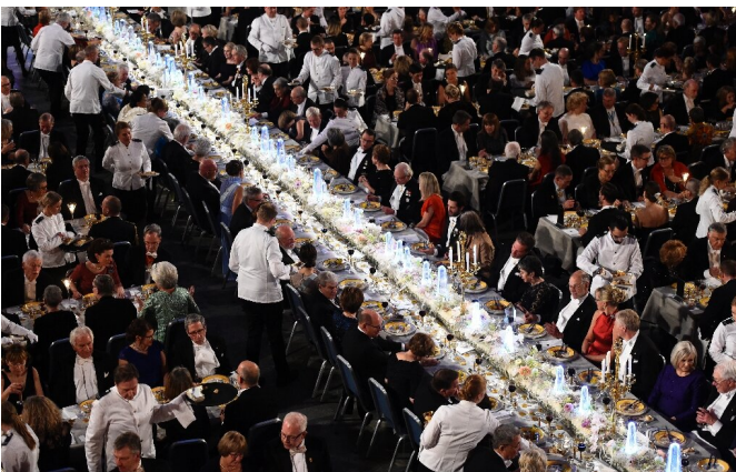
Nobel prize winners, royals and guests attend the 2017 Nobel Banquet

More recent science awards have done a better job in highlighting these large collaborations, said Rees.