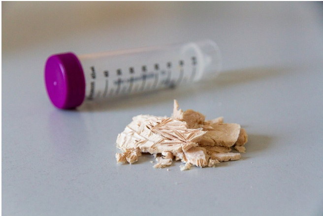
Freeze-dried bacteria ( Cupriavidus necator) before cell disruption.

Germany generates around 38 kilograms of plastic waste per capita each year. In a joint project with the University of Stuttgart and LCS Life Cycle Simulation, researchers from the Fraunhofer Institute for Interfacial Engineering and Biotechnology IGB and the Fraunhofer Institute for Process Engineering and Packaging IVV are now working to establish a holistic concept for the sustainable use of biologically degradable packaging materials in the cosmetics industry. The project is focusing on polyhydroxyalkanoates (PHAs), which have similar properties to conventional plastics but are produced from microorganisms and without the use of fossil-based raw materials.