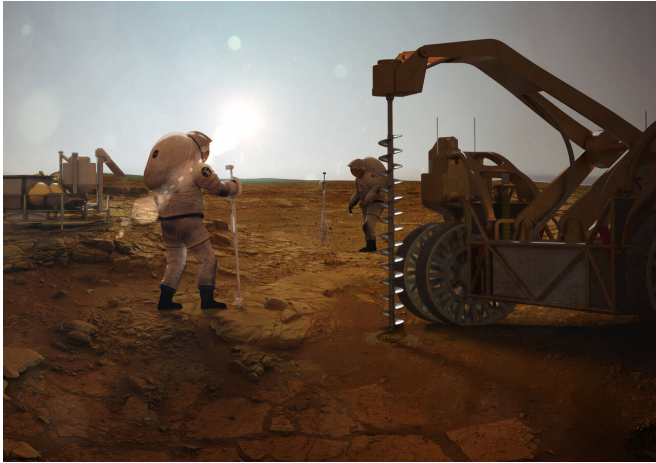
Artist's depiction of astronauts drilling for water on Mars during a future manned mission to the red planet.

Recent science missions and results are bringing the search for life closer to home, and scientists at the Center for Astrophysics | Harvard & Smithsonian (CfA) and the Florida Institute of Technology (FIT) may have figured out how to determine whether life is—or was—lurking deep beneath the surface of Mars, the Moon, and other rocky objects in the universe.