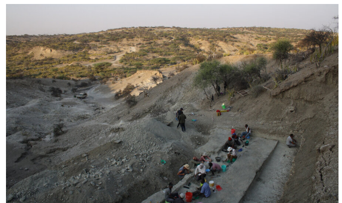
The team digging in a region of Olduvai Gorge, an archaeological site in Tanzania where remains of early human settlements have been previously unearthed.