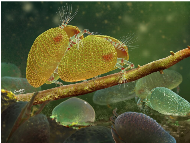
Artist's reconstruction of mating ostracods. Credit: YANG Dinghua

Research reveals that the repertoire of reproduction