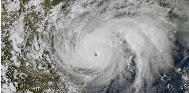
Hurricane Harvey set up a rare natural experiment to study the effects of fishing.