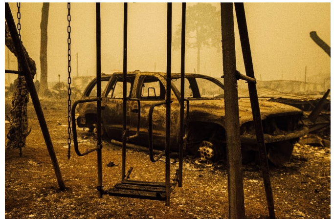
A charred swing set and car are seen after the passage of the Santiam Fire in Gates, Oregon

Two massive conflagrations threatened to merge south of Portland in Clackamas County, where a 10:00 pm curfew was announced for all non-emergency workers to clear the roads for patrol and evacuation efforts.