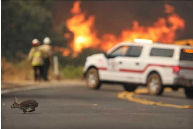
A rabbit crosses the road with flames from a brush fire along Japatul Road during the Valley Fire in Jamul, California on September 6, 2020

More than 20,000 firefighters from across the United States on Friday battled sprawling deadly wildfires up and down the West Coast—a wave of infernos that have forced more than half a million people to flee their homes.