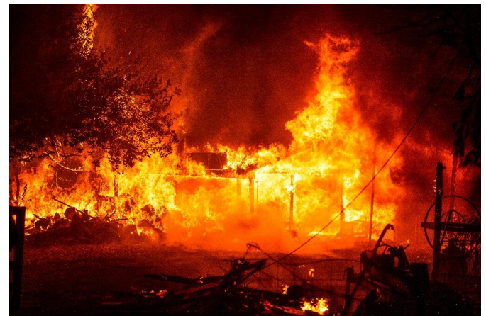
A home burns during the Bear fire, part of the North Lightning Complex fires in the Berry Creek area of unincorporated Butte County, California on September 9, 2020

Police went door to door to make sure that residents were evacuating the city of Molalla, marking their driveways with spray paint to show they had left.