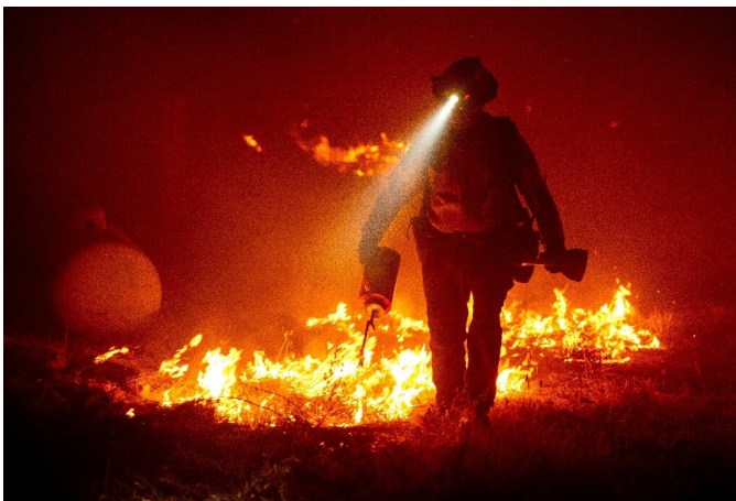
Firefighters cut defensive lines and light backfires to protect structures behind a CalFire fire station during the Bear fire

Humidity is expected to rise as temperatures cool through to next week, providing some relief, Cal Fire said.