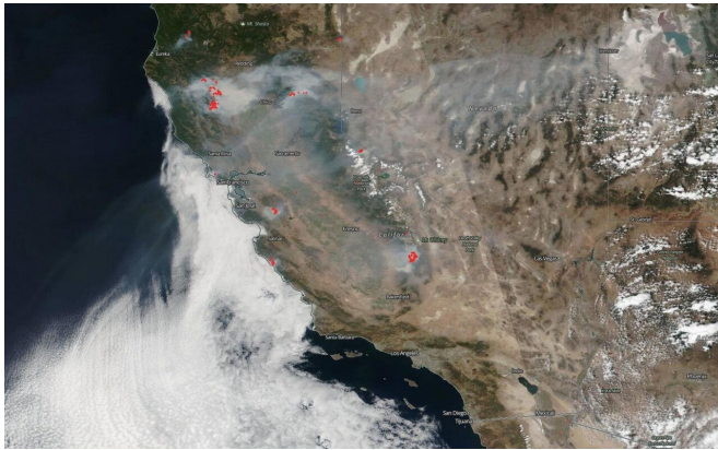
Image taken by Suomi NPP on August 30, 2020 shows the smoke and fires in California.

NOAA/NASA's Suomi NPP satellite captured two images that tell the story about the smoke coming off the fires in California. One instrument on the provided a visible image of the smoke, while another analyzed the aerosol content within. The images were captured on August 30, 2020.