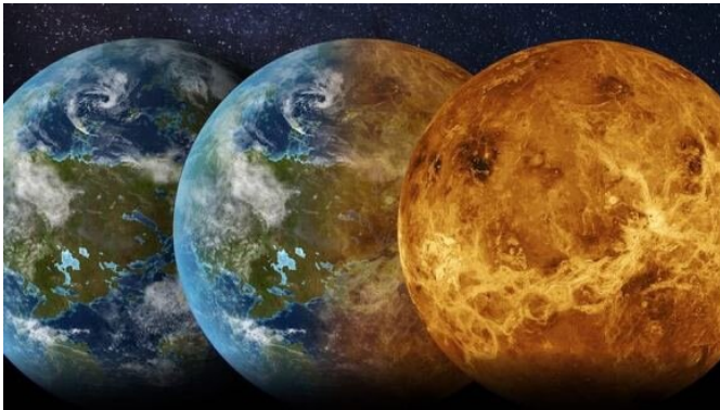
Artist's depiction of Venus evolving from a potentially habitable water world to the hot desert it is today.

However, highly orbital eccentricities have another effect on liquid water . They cause it to disappear. This is a two-step process. First, highly eccentric orbits cause significant seasonal changes, and can either freeze water into snow or ice formations when the planet is farther away from the star or evaporate it into clouds when the planet gets closer to the star. While the planet is close to the star, it is also subjected to significantly increased amounts of ultraviolet light. This UV light has the added effect of splitting water molecules, leaving only elemental hydrogen and oxygen. The lighter hydrogen can then easily be stripped away from the planet's atmosphere by the solar wind, never to be recombined into water.