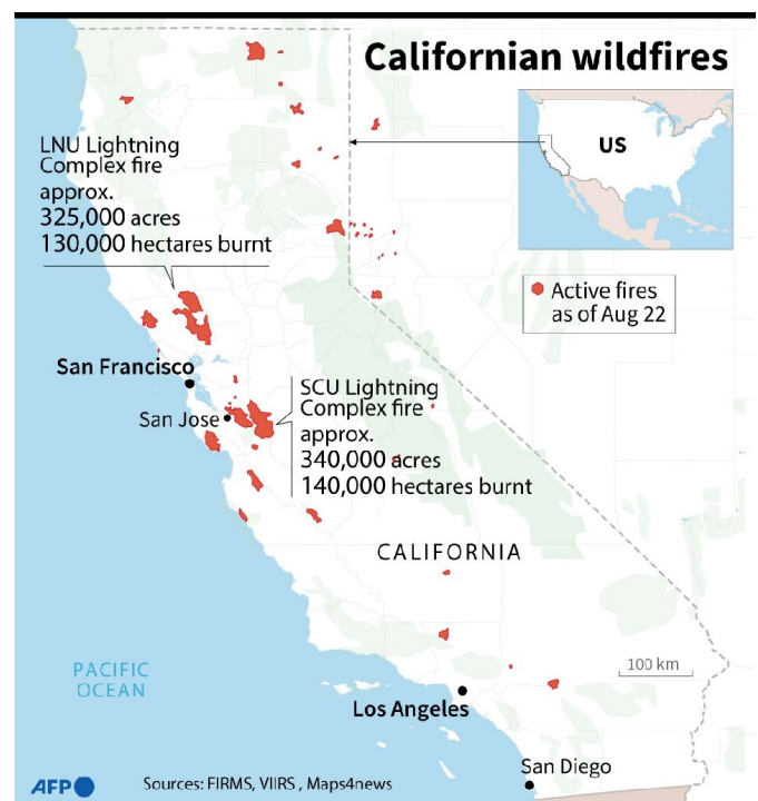
Map of California showing active wildfires as of Aug 22.

About 2,600 firefighters are now tackling the two largest blazes, out of roughly 14,000 battling "nearly two dozen major fires," according to Rahn.