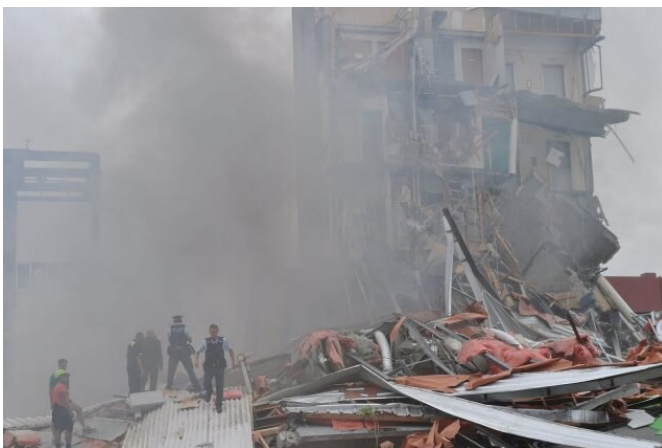
CTV Building in Christchurch 24 minutes after the earthquake.

Franz Josef is also accustomed to natural hazard risk as it is located in a multi-hazard area. The retreat of the Franz Josef glacier has increased the risk of rock falls, with tourist access limited as a result. Moreover, the accumulation of material like stone and sediment in valleys due to glacial retreat has raised the river bed of the Waiho River—which runs between the Fox and Franz Josef glaciers—and increased the risk of floods. With heavy rainfall in the region, the flood of the Waiho River in July 2019 destroyed a bridge connecting the two glaciers.