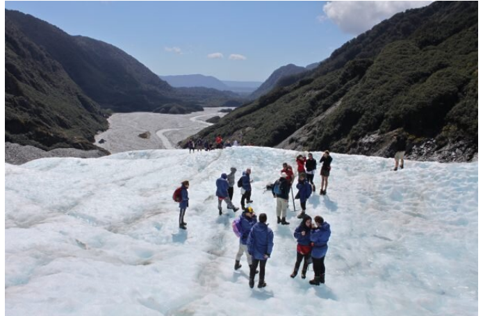
Franz Josef Glacier.