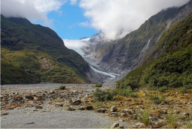
Franz Josef Glacier in New Zealand.

Running through the heart of New Zealand's glacier country is the infamous Alpine Fault. The 600 kilometer-long (370 mile) faultline on the boundary of the Eurasian and Pacific tectonic plates beneath the country's South Island produces infrequent but significant earthquakes. In the line of fire is the small town of Franz Josef, just 5 kilometers (3 miles) from the often-visited Franz Josef glacier in the Southern Alps or Kaititiri o te Moana (the Maori name), a popular destination for visitors. New research affirms that the next magnitude 8.0 (M8) Alpine Fault rupture, which has a 30 percent chance of occurring in the next 50 years, would devastate Franz Josef.