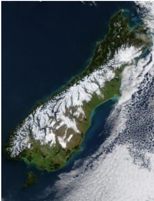
The Alpine Fault is visible as the boundary between the snow-covered Southern Alps and the green plains on the West Coast of New Zealand's South Island.