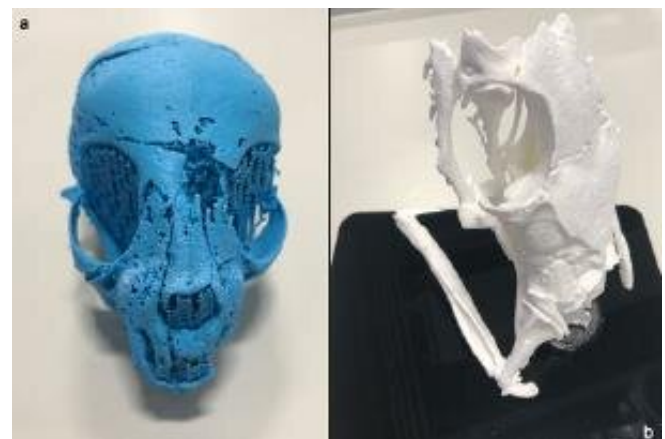
3D-prints from segmented X-ray micro tomography data. a cat mummy, b snake mummy. Credit: Swansea University

Digitally dissected lower jaw (mandible) and teeth of the mummified kitten. Reveals fractures and unerupted mandibular first molars (red) indicating it was a kitten at the time of death. Scale: skull total length = 68.9 mm. The cat is one of three mummified animals from ancient Egypt which have been digitally unwrapped and dissected by researchers, using high-resolution 3D scans that give unprecedented detail about the animals' lives - and deaths - over 2000 years ago. Previous investigations had identified which animals they were, but very little else was known about what lay inside the mummies. Now, thanks to X-ray micro CT scanning, which generates 3D images with a resolution 100 times greater than a medical CT scan, the animals' remains can be analysed in extraordinary detail, right down to their smallest bones and teeth. Credit: Swansea University