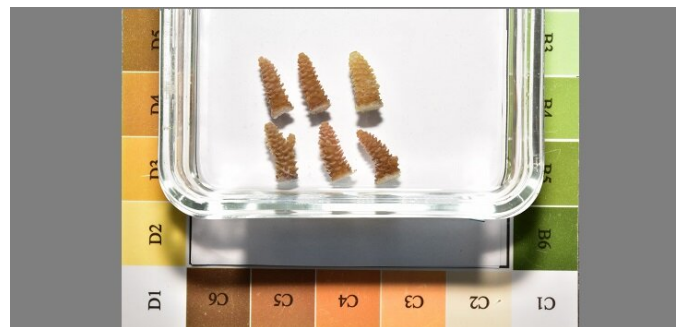
Fragments exposed to the oil pollutant, phenanthrene, are compared against the color index of a Coral Health Chart to observe for signs of bleaching distress.

The analysis showed that the corals accumulate similar total amounts of phenanthrene, whether via diffusion from the seawater or through uptake in their food. However, the rate of uptake was faster via seawater exposure than from feeding. Ananya Ashok, the lead author of the study, explains that this finding was counterintuitive and points out that uptake is only part of the picture. "It's not a one-way process. There's a dynamic process of accumulation and elimination constantly happening. It's possible that phenanthrene is being retained more from the diet even though it's taken up at a slower rate," she says.