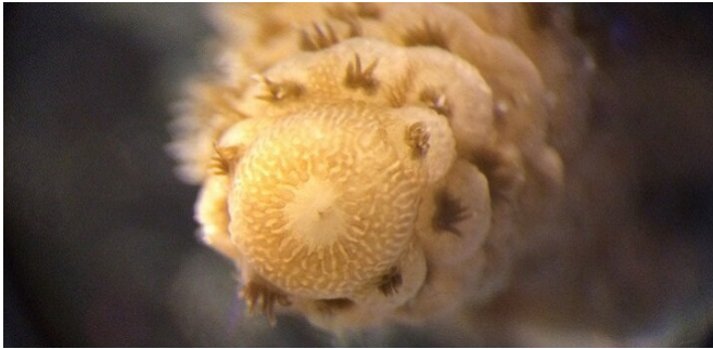
Corals take up marine pollutants directly from seawater as well as through accumulation in their food.

Marine pollutants are taken up by corals directly from seawater as well as through accumulation in their food, shows research from KAUST that uses a state-of-the-art spectroscopy technique known as cavity ring-down spectroscopy. This is the first time the approach has been used to measure pollutant accumulation.