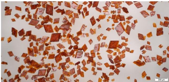
The copper nanoclusters formed beautiful red crystals.

A unique nanocluster of copper atoms created by KAUST researchers could serve as a roadmap to guide the design of new catalysts and imaging agents.