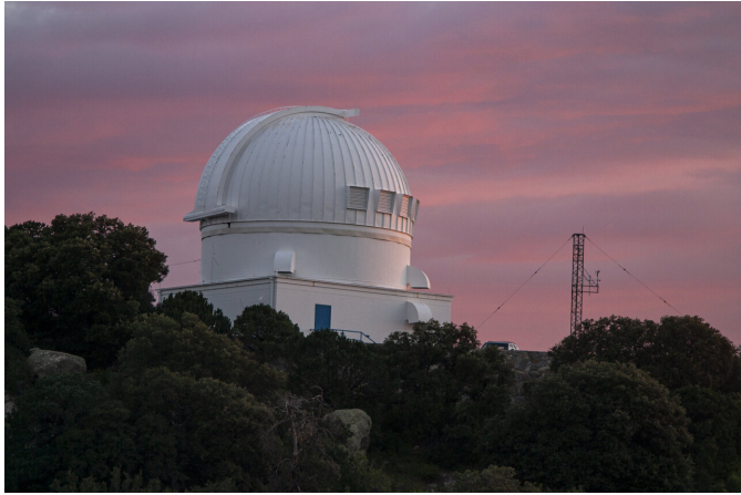
Sunset at the WIYN 0.9 Meter Telescope at Kitt Peak National Observatory

mass of Earth and then enrobing themselves in a massive gaseous envelope hundreds of times the mass of Earth. The result is a gas giant like Jupiter. K2-25b breaks all the rules of this conventional picture: With a mass 25 times that of Earth and modest in size, K2-25b is nearly all core and very little gaseous envelope. These strange properties pose two puzzles for astronomers. First, how did K2-25b assemble such a large core, many times the 5-10 Earth-mass limit predicted by theory? And second, with its high core mass—and consequent strong gravitational pull—how did it avoid accumulating a significant gaseous envelope?