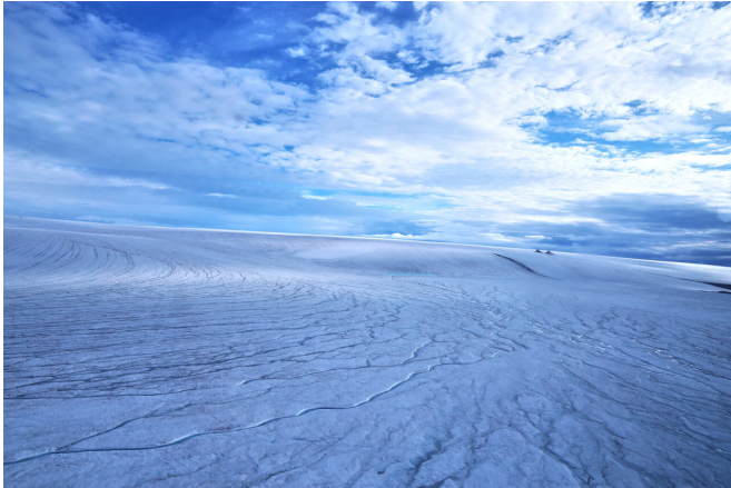
UBC researchers have concluded that early Martian landscape probably looked similar to this image of the Devon ice cap.

hundreds of valleys on Mars, and they look very different from each other. If you look at Earth from a satellite you see a lot of valleys: some of them made by rivers, some made by glaciers, some made by other processes, and each type has a distinctive shape. Mars is similar, in that valleys look very different from each other, suggesting that many processes were at play to carve them."