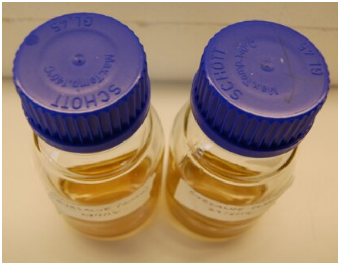
The Balds Eyesalve mixture in the lab.

Scientific Reports today the 28 July, researchers say medieval methods using natural antimicrobials from every day ingredients could help find new answers.