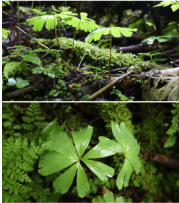
Draft genome for Kingdonia uniflora