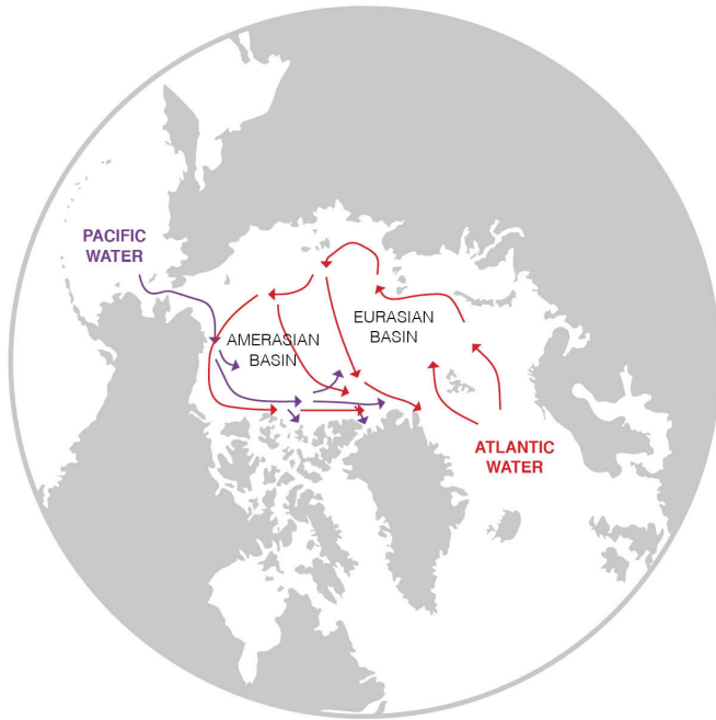
A map of the Arctic Ocean shows the location of the Amerasian and Eurasian basins. Arrows show the path of warm, fresh Pacific water and warm, salty Atlantic water into the region. Credit: Graphic adapted from Polyakov et al. 2020, Frontiers in Marine Science paper.

New research explores how lower-latitude oceans drive complex changes in the Arctic Ocean, pushing the region into a new reality distinct from the 20th-century norm.